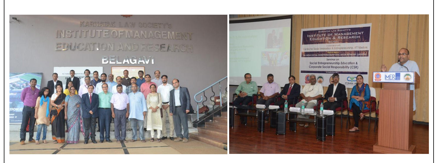
UKISEEN Seminar on Social Entrepreneurship in KLSIMER Belgaum